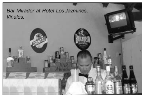
Bar Mirador at Hotel Los Jazmines, Viñales.