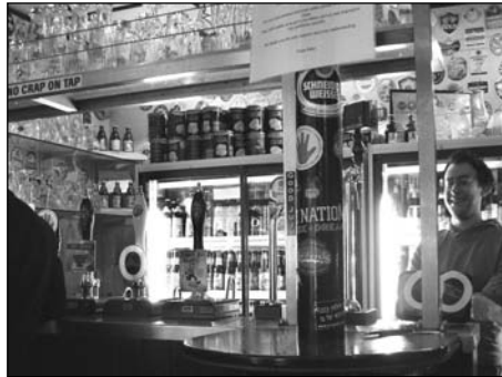
The bar at the Rake

Richard Dinwoodie and Mike Hill who were already running the Utobeer stall in the middle of Borough market. Depending on the day and time of your visit you may find the Rake busy with market traders, foodie shoppers or beer enthusiasts. The small bar has room for three high, round, tables and the walls are decorated with an international mixture of enamel brewery signs and handwritten messages from visiting brewers. Three handpumps serve an ever changing mixture of unusual cask ales. Several fountains dispense draught beers from Belgium, Germany and the USA. A large fridge stocks a huge range of specialist bottled beers. The limited bar snack list notably includes Mrs King's pork pies. Originally open from Monday-Saturday, trial opening on Sundays commences on 27 February. www.therakeblog.wordpress.com