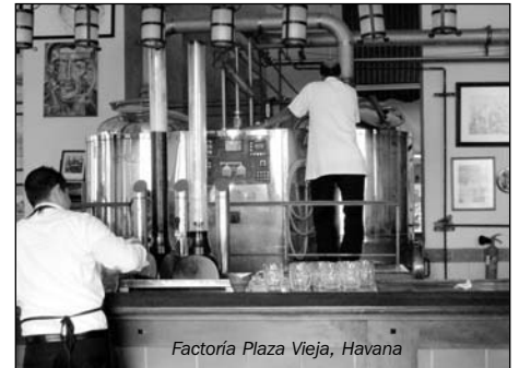
Factoría Plaza Vieja, Havana

Things are definitely looking up for Cuba's beer enthusiasts. The capital has just acquired its first brew pub! The Taberna de la Muralla in Havana has recently been refurbished as the Factoría Plaza Vieja, with an authentic nineteenth century look. The choice here is restricted to light